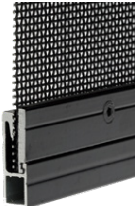
Cross section of mesh and frame