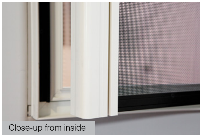
Close-up from inside